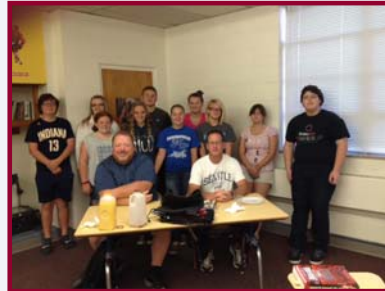
Duggar Union FCA