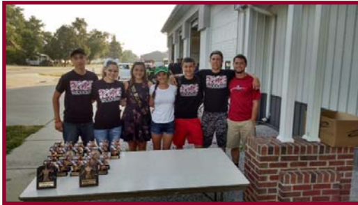
North Knox FCA Labor Day Run workers.