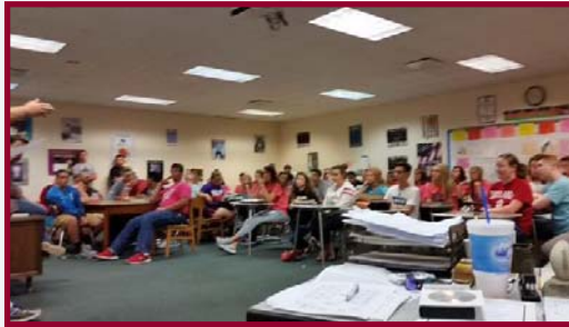
Boonville HS 1st FCA Huddle Meeting