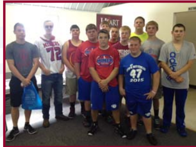
Linton Football players at Hamilton Center Health Fair